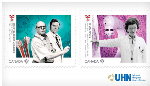
Recognized for Pushing the Envelope /read more