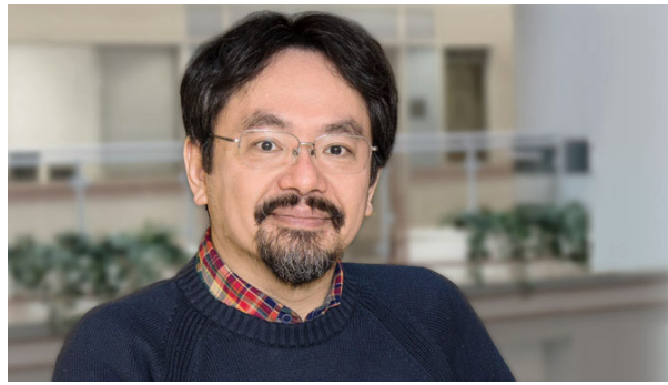
The Future of Cancer Treatment /read more